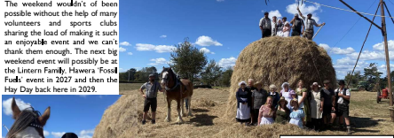
Above: The Honour Family

Locally owned & operated Helping Tararaki families with a range of simple, a simple cremation & burials professional funeral services.