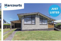
Inglewood 40 Elliott Street Buyer Enquiry Over $755,000

New Listing. Calling all First Home Buyers! Here is your chance to grab a tidy 3 bedroom home. * Sunny open plan living * Brick exterior with under cover patio area * Internal access garage with the bonus of extra shed in the backyard * 74m2 section, fully fenced backyard A great opportunity to secure your first home in Inglewood, properties in this price bracket are hard to come by. Early viewing recommended.