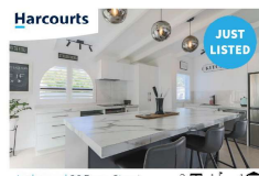
Inglewood 36 Rewa Street Buyer Enquiry Over $680,000

Step inside this stylishly modernised, Mediterranean style home to fully appreciate all the stunning features and the work that has gone into this immaculate property. This 3 bedroom home is an entertainer's delight, with stunning brand new executive kitchen, large kitchen island with seating. Featuring multiple entertaining areas for any occasion, weather or time of the day! Beautiful light and bright, open plan living area, with conservatory style dining area. The whole home has new double glazed aluminium windows, carpet and decor. Brand new bathroom, 2 toilets, step down master bedroom with doors opening to sunny courtyard, single garage and carport. Located on a kids corner section in a prime location, handy to schools and sports grounds.