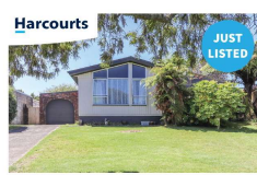
Inglewood 25 Konini Street Buyer Enquiry Over $550,000

Imagine yourself in a stylish, executive home, located in one of Inglewood's most sought after subdivisions. This 3 bedroom brick beauty is just over a year old with immaculate presentation inside and out. Prepare to be impressed by this modern home with a sleek and simplistic design. Tastefully decorated with a contemporary colour palette. Featuring gorgeous polished concrete floors, sunny open plan living with generously proportioned stacker doors creating seamless indoor/outdoor flow. Modern luxuries include double glazing, heating/cooling, gas infinity and master with walk through wardrobe. Why build? All the hard work has been done - decking, concrete driveway, established lawn, and low maintenance landscaping.