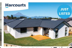
Inglewood 8 Hodge Park Lane Buyer Enquiry Over $735,000

Step inside this stylishly modernised, Mediterranean style home to fully appreciate all the stunning features and the work that has gone into this immaculate property. This 3 bedroom home is an entertainer's delight, with stunning brand new executive kitchen, large kitchen island with seating. Featuring multiple entertaining areas for any occasion, weather or time of the day! Beautiful light and bright, open plan living area, with conservatory style dining area. The whole home has new double glazed aluminium windows, carpet and decor. Brand new bathroom, 2 toilets, step down master bedroom with doors opening to sunny courtyard, single garage and carport. Located on a kids corner section in a prime location, handy to schools and sports grounds.