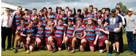
Above: Inglewood High School 1 st XV Below: Inglewood High School Under 15 (L-R)

Saturday brought a finals win for the 1st XV and the last game for an unbeaten season for the Under 15 who didn't have finals because of Covid. The 1st XV won their final against Central 23 to 12. They played in the under 19 grade which incorporates clubs like Central. The players and coaches were extremely happy to have a season after Covid wreaked havoc on the sporting world, although it did make it a long season to keep themselves motivated and fit for when play did recommence. Thank you to the coaches, managers etc for investing in the teams and sacrificing their time. Congratulations boys, an excellent season and a well deserved final win.