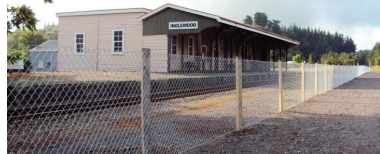
Above: Inglewood's version of the Berlin Wall

There will be a Public Meeting in the Town Hall Super Room on Thursday 11 February at 7.30 pm for the town to air their views. KiwiRail have been sent an invitation. If you have an opinion or your want to hear other opinions the opportunity is now in your hands.